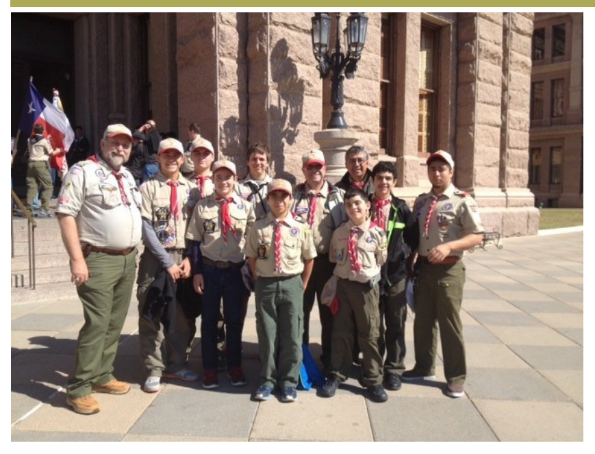
Report to State RGC contingent in front of the capitol in Austin for the Report To State.

"The Boy Scouts of America will prepare every eligible youth in America to become a responsible, participating citizen and leader who is guided by the Scout Oath and Scout Law."