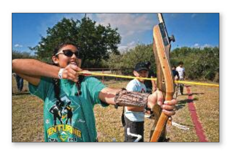
Camp Perry is AFFORDABLE .

for all the youth of the Rio Grande Valley.